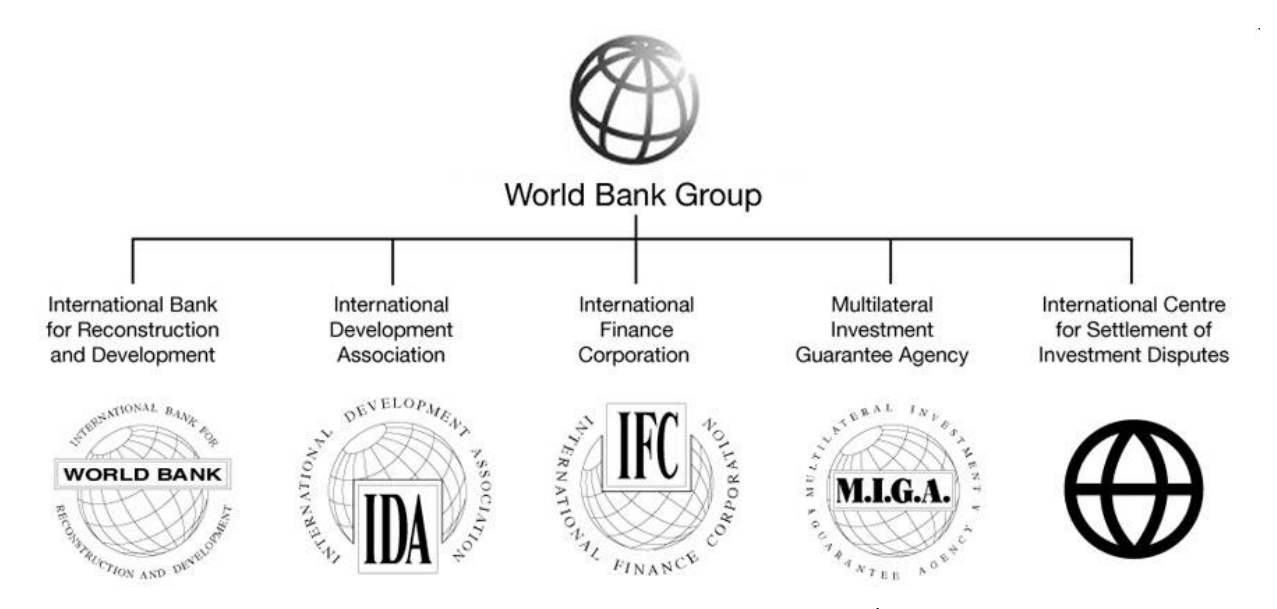
Structure of the World Bank Group<sup>4</sup>

Today the World Bank pursues two goals: to end extreme poverty, and to promote shared prosperity. It aims to achieve these goals through granting low-interest loans, zero- to low-interest credit and grants to developing countries, assisting them in funding projects in areas such as education, infrastructure, healthcare, public administration, agriculture and environmental resource management.<sup>5</sup>